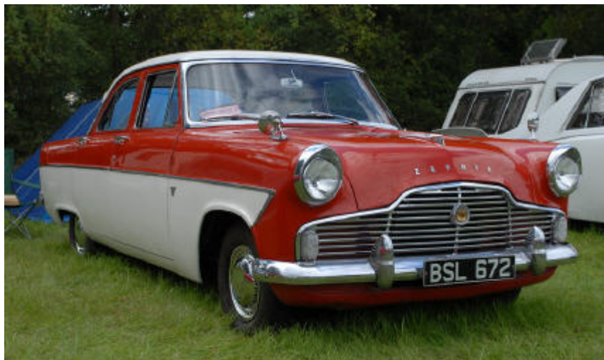
Lovely old Zephyr at Rudgwick Steam Fair