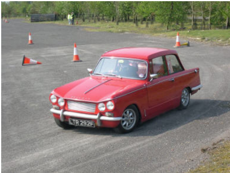
Duncan Wild having way too much fun at the Spring Solo!