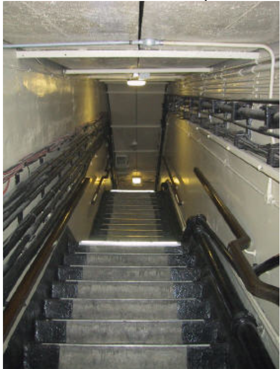
Looking back up the stairs to the outside world

During the visit, some of the presentation had sounded vaguely familiar from my O-level history days but sitting in the room where it all took place brought it to life. I had never really appreciated before, how few RAF planes were available to be sent up against the Luftwaffe and how vulnerable Britain really was at the time of the Battle of Britain. I have a renewed respect for all those involved at the time.