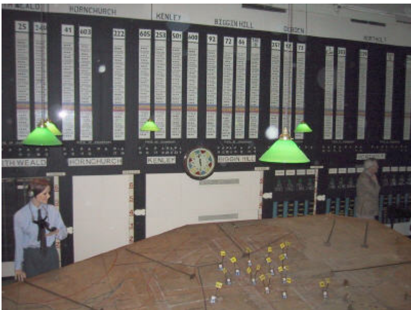
The plotting room

From the Plotting Room, we were taken into the Briefing Room which is now set up for film shows. We saw a video of archive footage from the time and interviews with veteran pilots. The stories they related were both inspiring and thought provoking. Including a