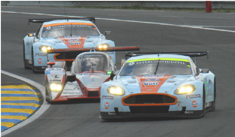
Aston Martins on the Porsche Curves at Le Mans!