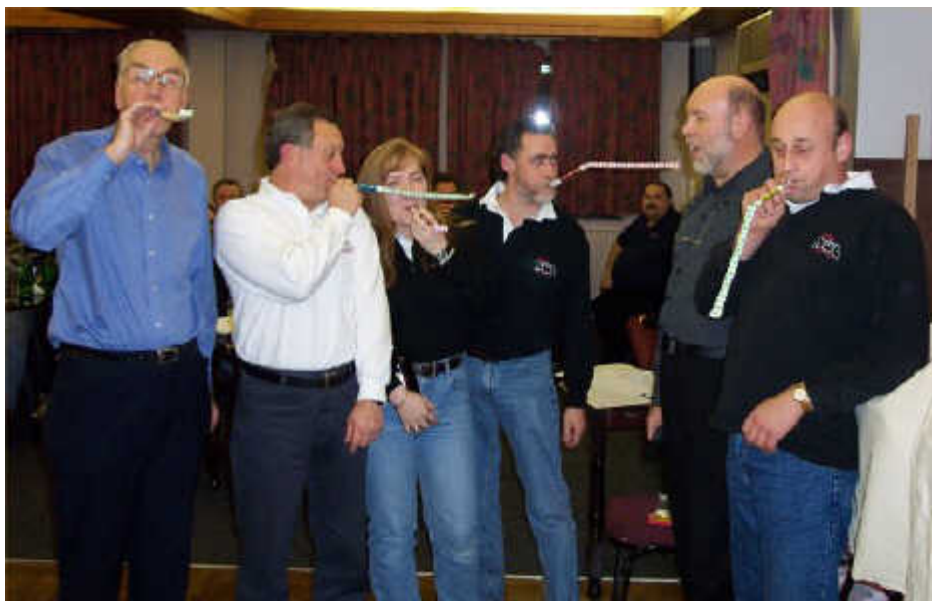
North West London behaving strangely at the Quadruplex!!