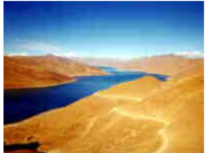
One of the many mountain roads

The scenery was breathtaking. Notable images which have stuck with me include the camps in the shadow of Mount Everest, crowds of people welcoming the rally through their remote towns and the contrast of the roads in some of the deserts with those in Iran where the oil money has paid for smooth tarmac.