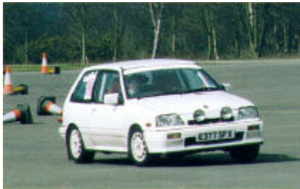
Ian Perry on course for a class win

Long version: A couple of hundred cones (I counted...) laid out into a large forward only, 1 st / 2 nd gear autotest plus a capacity entry of a hugely varied selection of cars was the recipe for an excellent days motorsport.