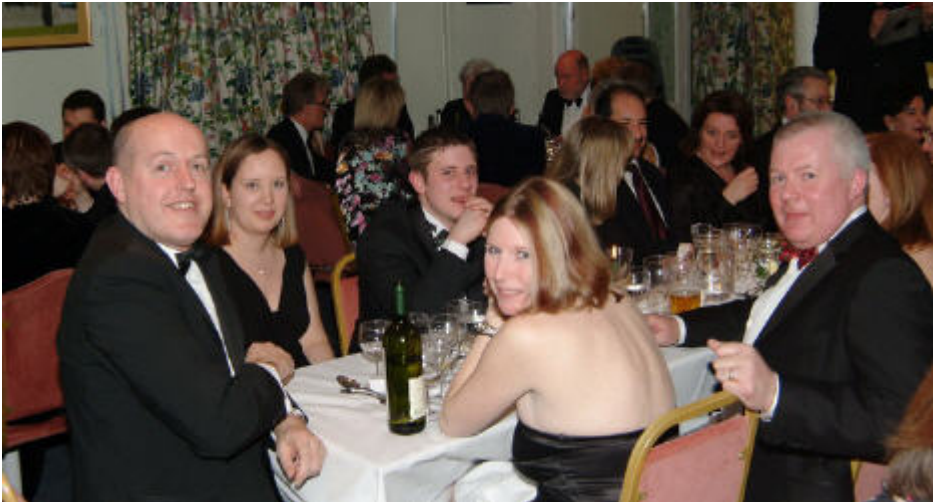
WMx Annual Dinner 2005!