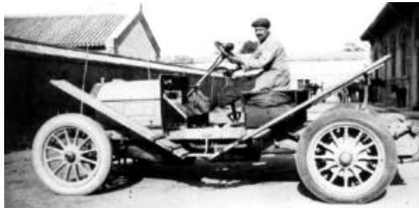
Prince Borghese's journalist navigator with their car which had mud guards made from the floor boards of their hotel room!