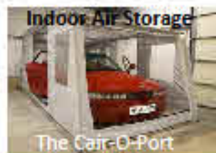
Indoor Air Storage